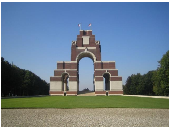
Thiepval Memorial to the Missing