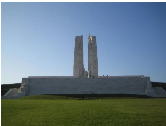
Vimy Ridge Memorial to the missing