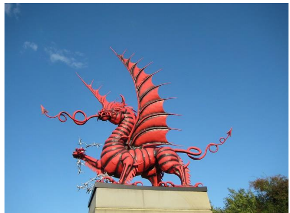
Mametz woods memorial for the Welch